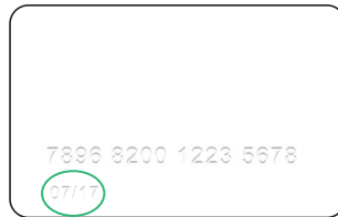
Any card with AVCARD