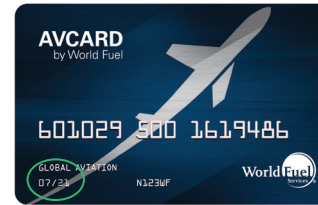
AVCARD® by World Fuel