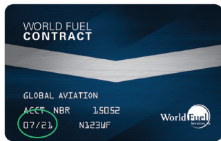
World Fuel Contract