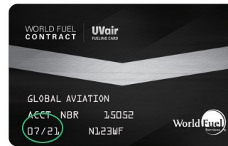
World Fuel | UVair Contract